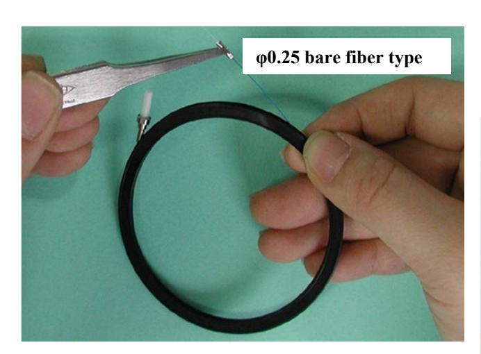
Ultra-compact reels for fiber optics from device production to FTTH lines!